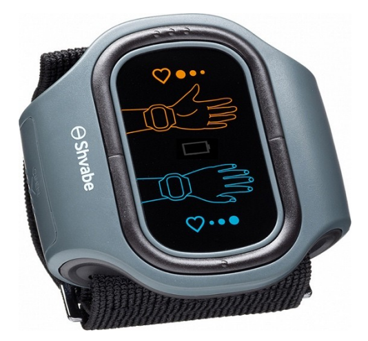
Fig. 1. Appearance of transcutaneous electrostimulator for BP correction "ABP-051".

The appearance of the device is shown in Figure 1.